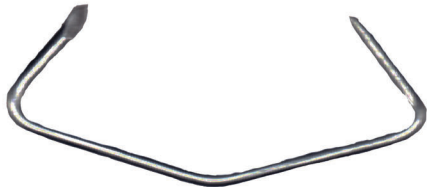
HG-4 or HC-4