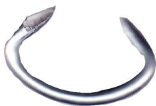
NO. BL 1-10