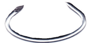
BG-3 OR BC-3