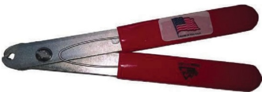
#R10-J-Klip 7.375"x2.75"x.8" $6.05 Use on J-Klip Rings

Note: Due to recent volatility of raw materials, price and delivery are subject to change based on availability at time of order.