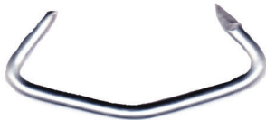
HG-3 or HC-3