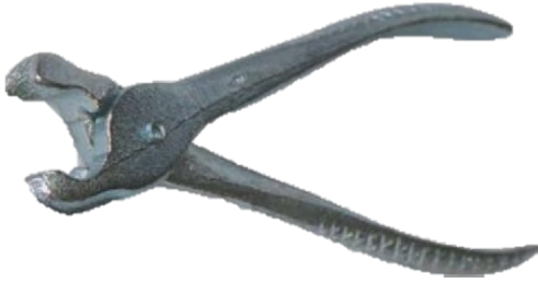
#R3-Fish Hook Ringer 6.875"x1.125"x.7" $20.55 Use on Fish Hook Rings