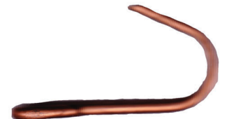
FHC-3 FISH HOOK