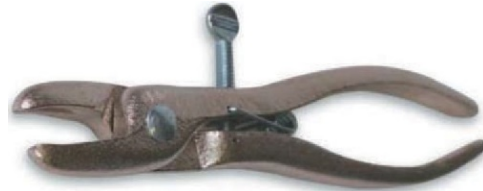
#R9-Hill M.I. Ringer with Spring 6.625"x1.75"x.7" $6.23 Use on 12 1/2 Gauge Rings